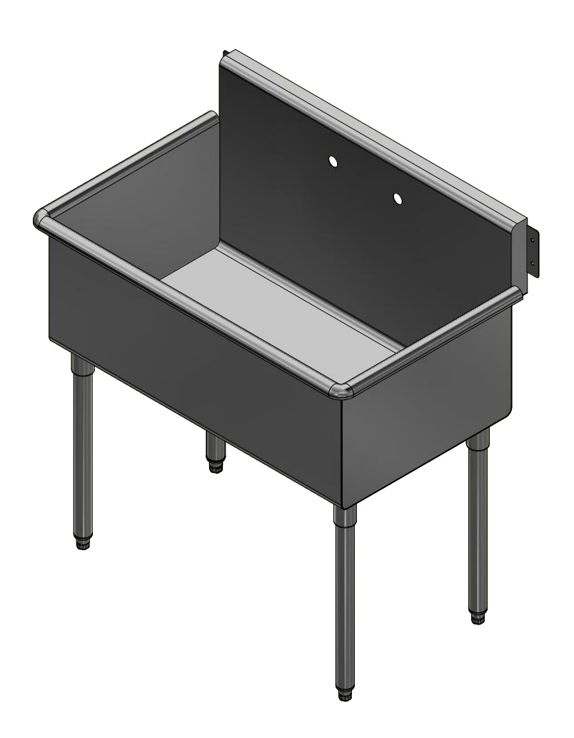
3D SCALE 1/12